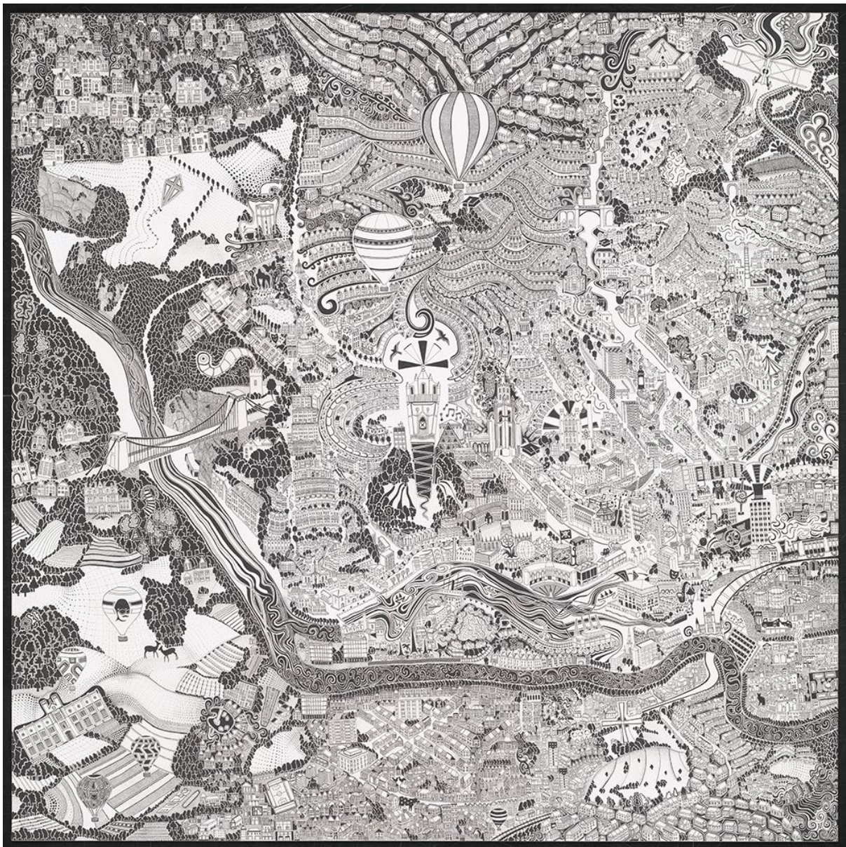
Bristol Map Copyright Fuller